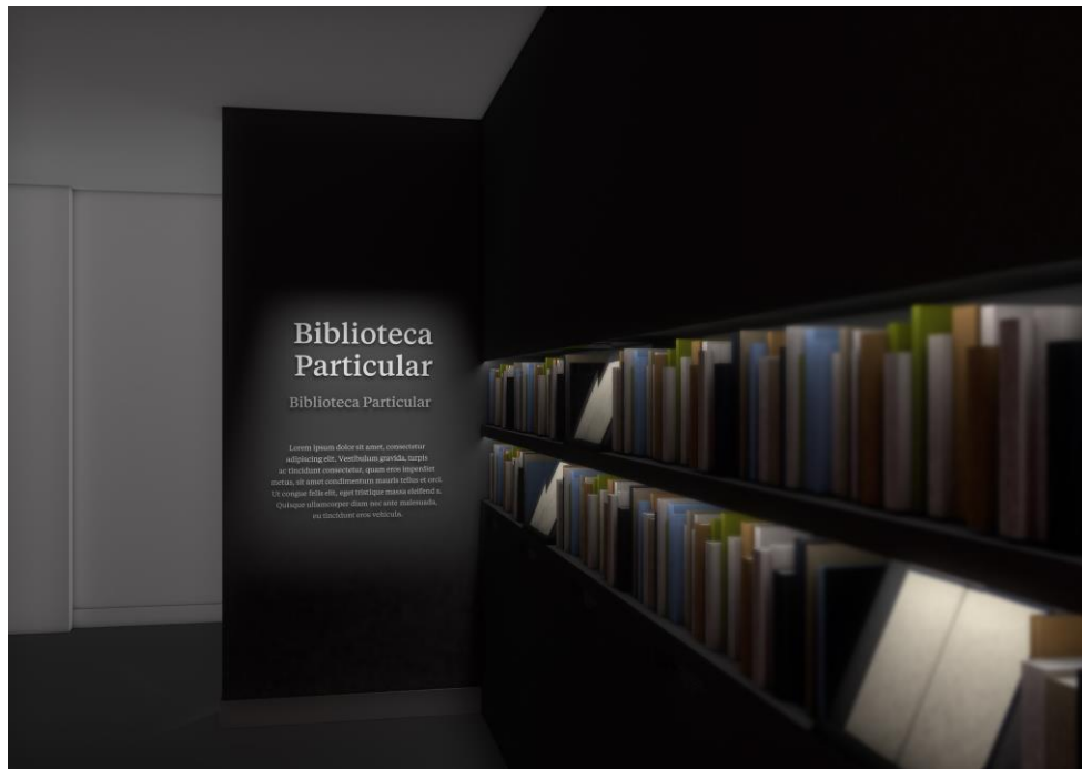
2 nd floor – Library