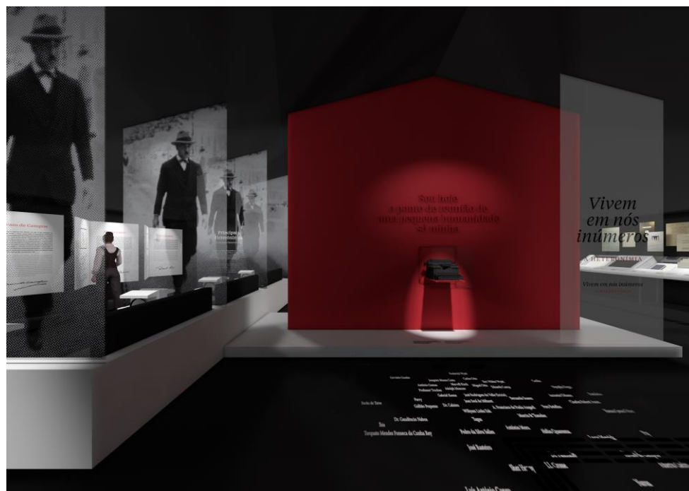
3 rd floor – Typewriter